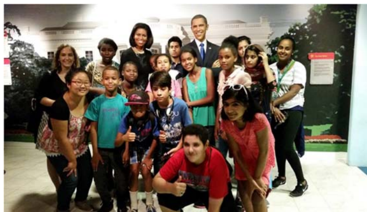
Bottom: Youth group trip to Madame Tussaud's Wax Museum in Washington, D.C.