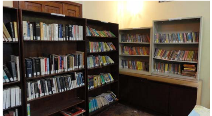
A history book collection on the first floor.

The current library continues to operate six days a week, 12 hours each day, and is open to all members of the City of Axum. The library is not currently able to check out books to its patrons. One of the library's top needs is a modern cataloguing and borrowing system.