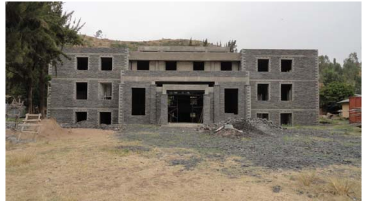
An outside look of the construction of the new library in December 2015.