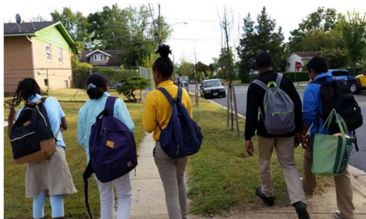
Top: ACC youth clients with new backpacks and school supplies at the beginning of the school year.

On June 9, 2015, ECDC collaborated with Lutheran Social Services, the American Red Cross, and the Montgomery Office of Community Partnerships to host World Refugee Day at the Silver Spring Civic Center. The ACC DC Metro held its 3 rd Annual Refugees' First Thanksgiving Dinner on November 26, 2014, which was attended by nearly 300 guests.