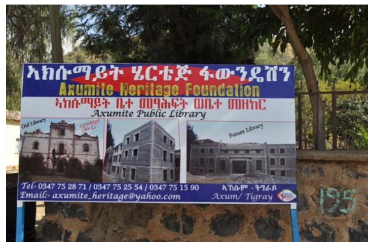
A sign for the library in the city of Axum.